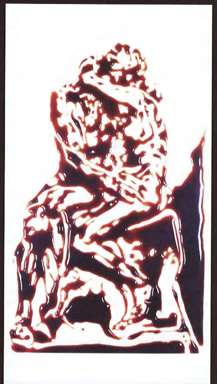
The Kiss, after Rodin, Vik Muniz, 1999