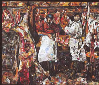
The Butcher's Shop, after Annibale Carracci, Vik Muniz, 2011