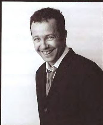
Portrait of Vik Muniz