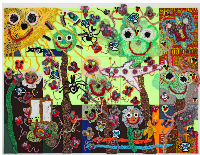
Fôret, 2021 Crochet sur toile / crochet on canvas 300 x 400 cm / 118 x 157 1/2 in