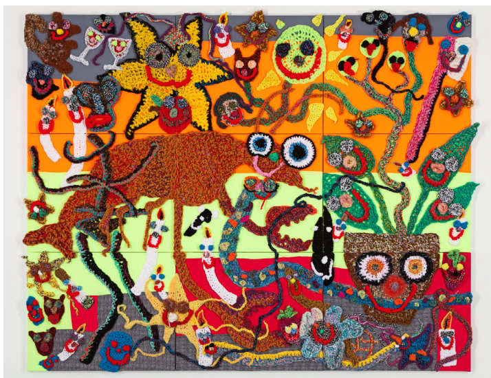
Festin , 2021

Crochet sur toile / crochet on canvas 240 x 200 cm / 94 1/2 x 78 2/3 in