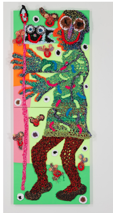
Sentinelle , 2021 Crochet sur toile / crochet on canvas 200 x 80 cm / 78 2/3 x 31 1/2 in