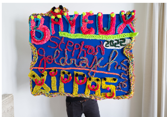
Stephan Goldrajch, Bayeux , 2021. Crochet on canvas, 80 x 100 cm. © Stephan Goldrajch. Photo : Myriam Rispens.

Opening on Saturday January 22, 11 am - 8 pm