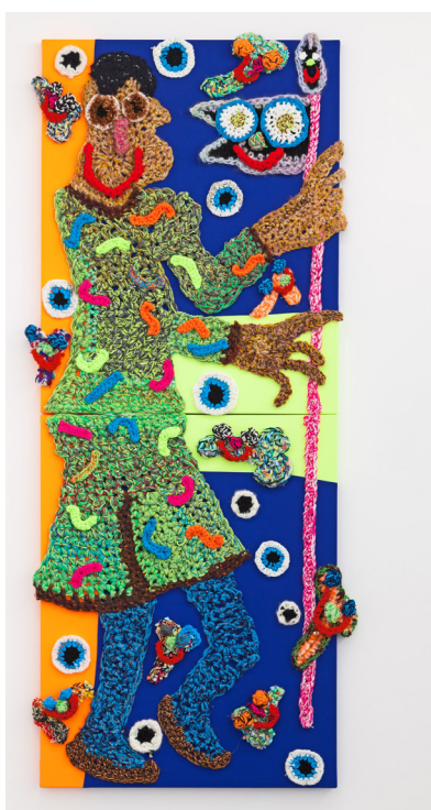
Sentinelle , 2021 Crochet sur toile / crochet on canvas 200 x 80 cm / 78 2/3 x 31 1/2 in