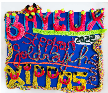
Flyer (Bayeux Xippas 2022), 2021 Crochet sur toile / crochet on canvas 80 x 100 cm / 31 1/2 x 39 1/3 in