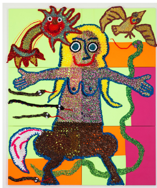
Centauresse , 2021

Crochet sur toile / crochet on canvas 140 x 100 cm / 31 1/2 x 39 1/3 in (chaque / each)