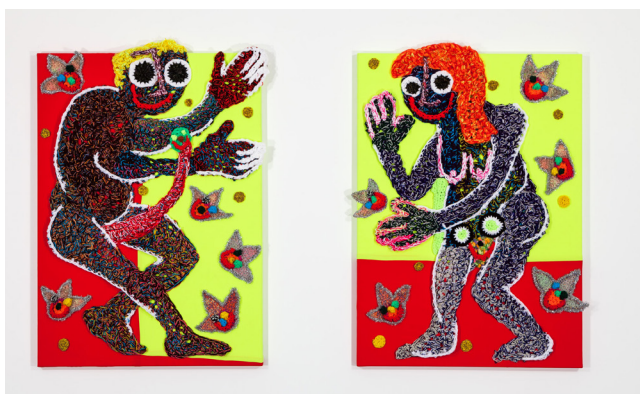
Les nus , 2021

Crochet sur toile / crochet on canvas 140 x 100 cm / 31 1/2 x 39 1/3 in (chaque / each)