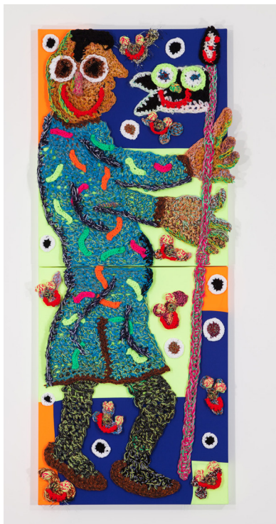
Sentinelle , 2021 Crochet sur toile / crochet on canvas 200 x 80 cm / 78 2/3 x 31 1/2 in