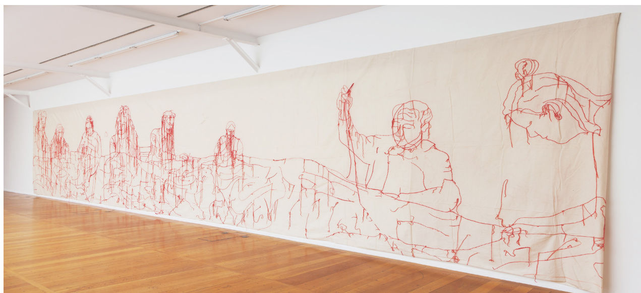
Les brodeurs, 2018 Broderie sur toile / embroidery on canvas 300 x 1520 cm / 118 x 598 1/2 in