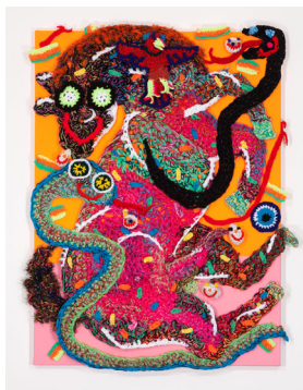
Cheval , 2021

Crochet sur toile / crochet on canvas 140 x 100 cm / 55 x 39 1/3 in