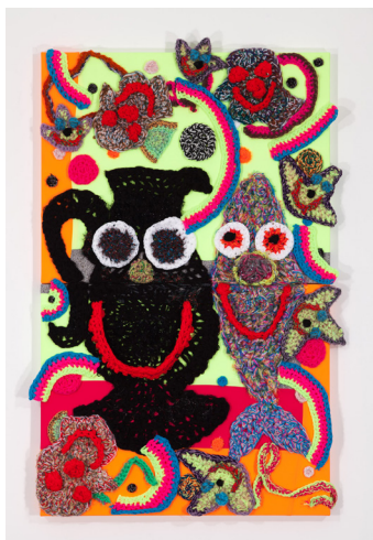
Poisson/cruche , 2021 Crochet sur toile / crochet on canvas 160 x 100 cm / 63 x 39 1/3 in