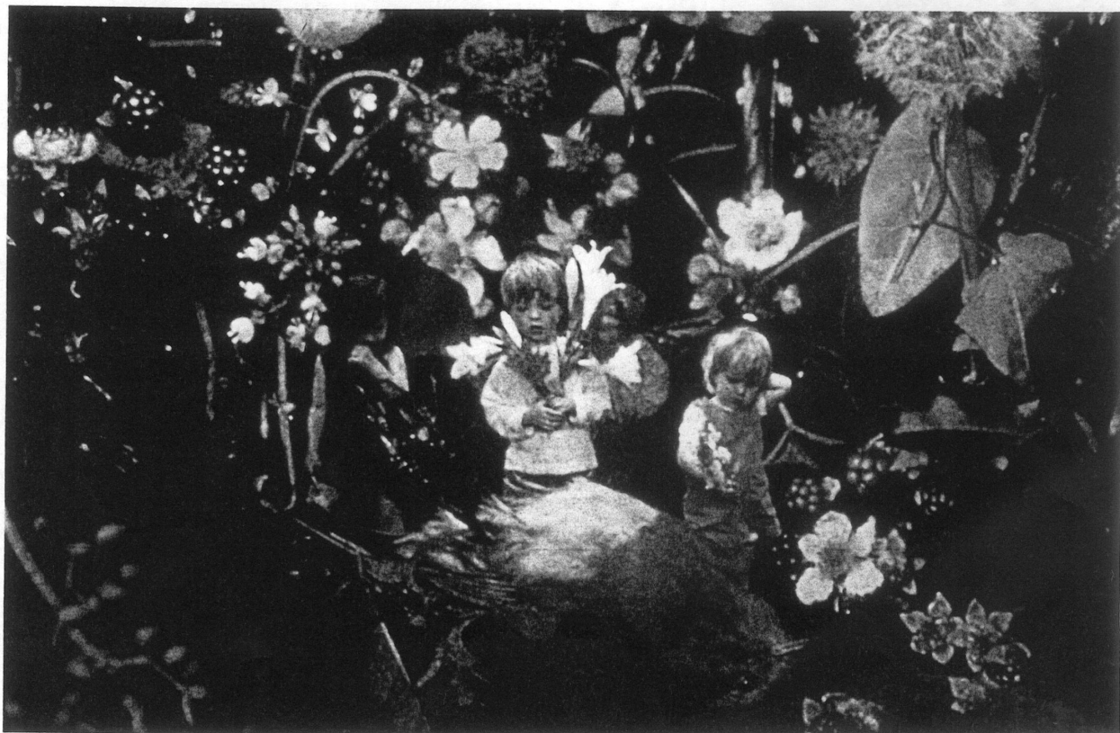
Mat Collishaw Duty Free Spirits 1997